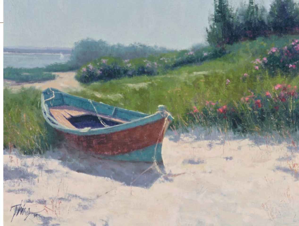
LEFT Sacred Pines 2004, oil, 30 x 18. Private collection.