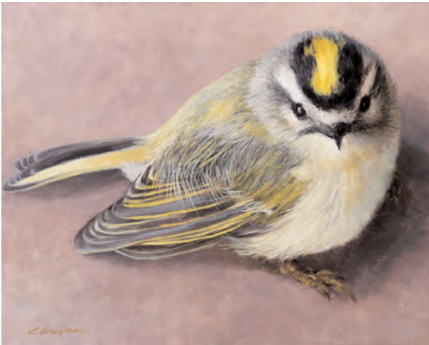
"A Closer Look- Golden Crowned Kinglet" oil 16 x 20 © Carol Guzman